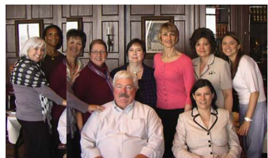
All the "Discussers"

The meeting was very well received by those in attendance, and the feedback received has confirmed that the approach was appreciated and the discussion deemed valuable.