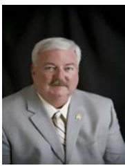
See 'Sacrifice' at page 3

That word "sacrifice" provides a guide for some ideas I would like to share that I hope you will consider.